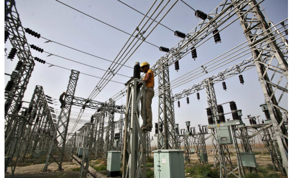
Figure 6: Electric power station

Power stations, generators, transformers, rectifiers, conductors and electrolysis includes a wide variety of equipment that operates at very low frequency 50/60 Hz generating Important electromagnetic fields.