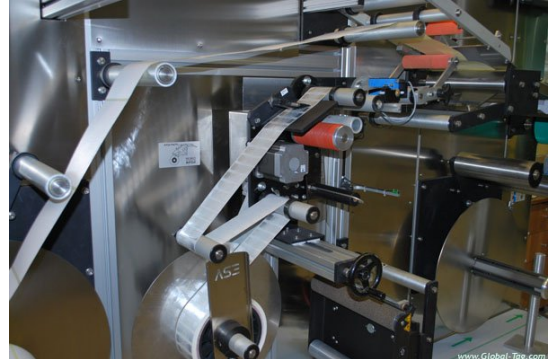
Figure 4: RFID sandwich machine

Electronic articles, RFID systems and detectors in general are very common in public spaces. This big variety of systems generate complex fields. Most of this systems operates within low frequency range which make using the SMP2 the adequate solution.