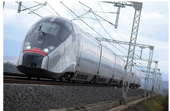
Figure 7: Rail-road power lines