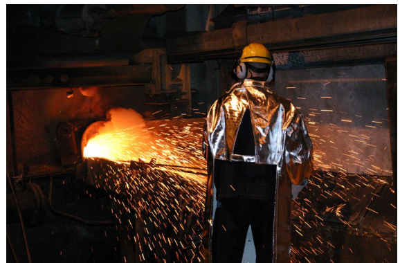
Figure 3: Industrial smelting