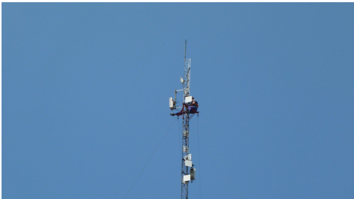
Figure 1: Worker on a Telecom mast