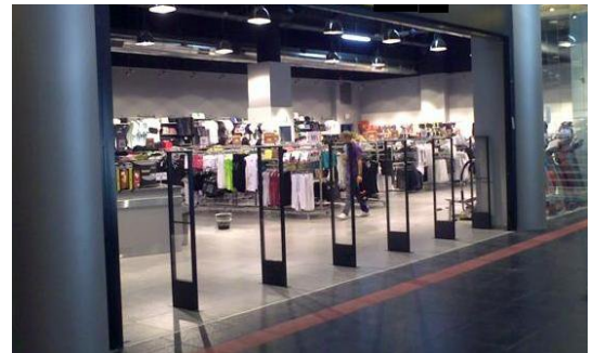
Figure 5: Electronic article surveillance machines