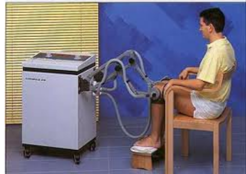
Figure 10 :Medical diathermy machine

In medicine, both the medical staff and patients are exposed to EMF fields generated by equipment related to Diathermy , RF generating medical devices and MRI machines . SMP2 is the adequate solution to make measurements of the EMFs generated by these machines.