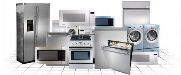
Figure 12: Household machines

Many people are surprised when they become aware of the variety of magnetic field levels found near various household appliances. The field strength does not depend on how large, complex, powerful or noisy the device is. Furthermore, even between apparently similar devices, the strength of the magnetic field may vary a lot.