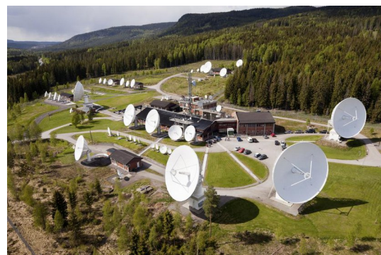
Figure 8: Radio TV base station

Mobile telephony, radio and television transmission is now commonplace around the world. These technologies rely upon an extensive network of fixed antennas, or base stations, transmitting information with radiofrequency (RF) signals. Millions of base stations exist worldwide and the number is increasing significantly with the introduction of new generation wireless technologies. The SMP2 is an ideal equipment to measure and survey the population exposure to electromagnetic emissions in public and private environments.